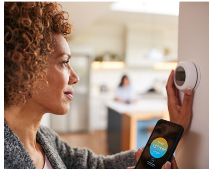
Smart devices like thermostats, electric vehicle chargers, and home batteries make it easy for you to participate.

The Power Response Smart Home Program provides financial incentives to participants for reducing energy usage during Energy Saving Events called by CPA. Conserving energy during this time can reduce stress on the electricity grid and can lead to lower greenhouse gas emissions.